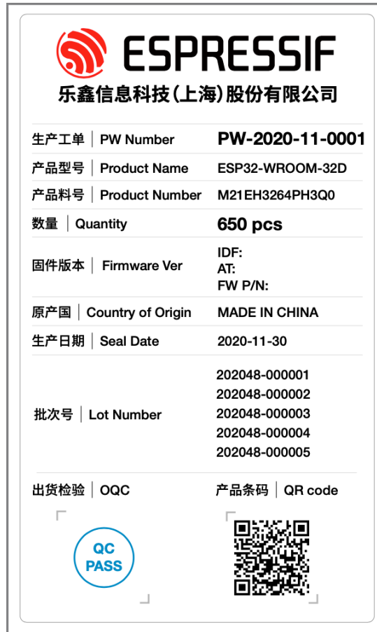
Figure 2: Module Product Label